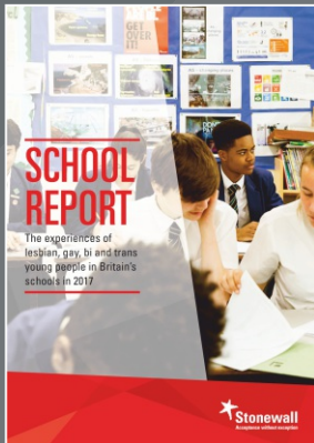
Stonewall School Report 2017