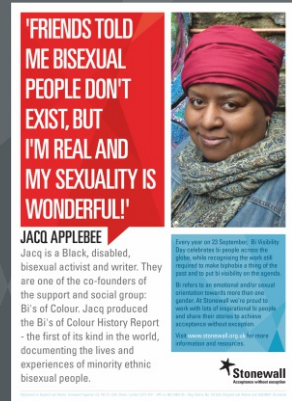
Bi Visibility Day 2017 poster campaign