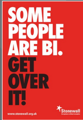
Some people are bi. Get over it poster (A4)